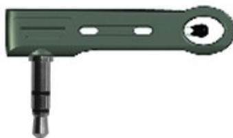
Figure 2: Temperature sensor Instruction