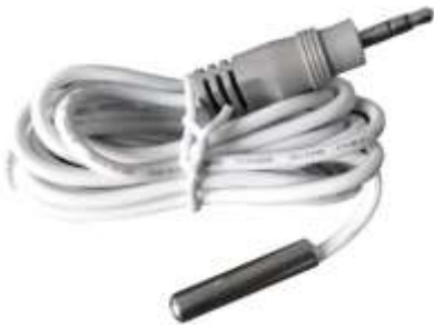
DTS-002 Temp sensor