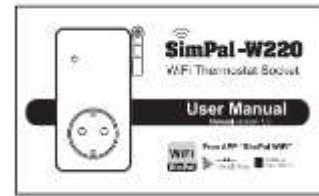
User manual (1 pcs)