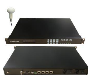
GTT400 ( 4 LAN Ports)