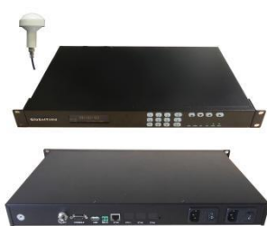
GTT100 ( 1 LAN Port)