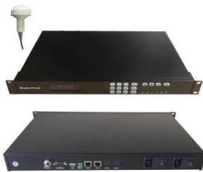
GTT200 ( 2 LAN Ports)